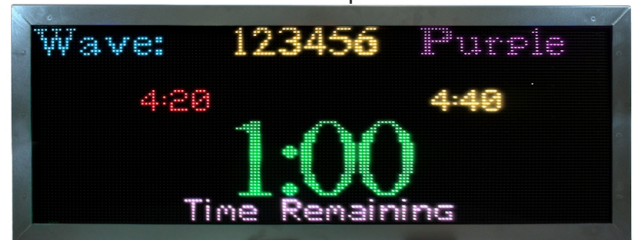
Example of Stainless Steel model

Conforms to ANSI/UL STD 48 Certified To CAN/CSA STD C22.2 No.207