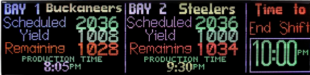
Example of Standard model